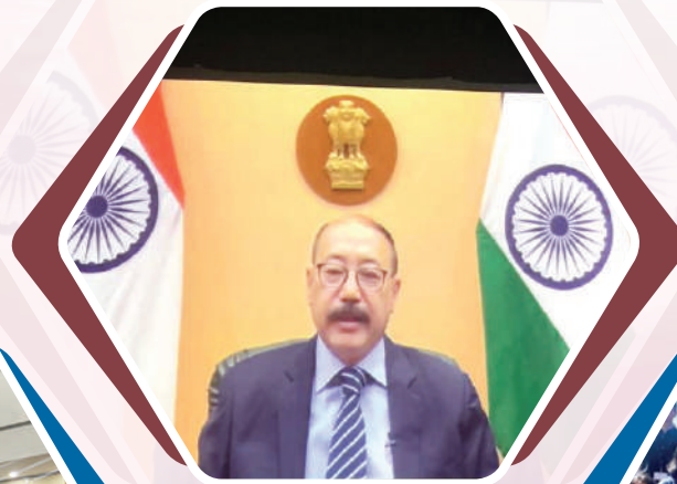
Shri Harsh Vardhan Shringla, Foreign Secretary virtually addressing the participants

the first-ever foreign policy module conducted as part of the Foundation Course for civil servants and the first of its kind training module on India's neighbourhood. There was an overwhelming response to the training module, both from the guest faculty comprising retired Ambassadors (who have either dealt with these countries or have served as Ambassadors in these countries) and the Officer Trainees who appreciated this attempt to better familiarize the civil servants regarding the dynamics of India's relations with its neighbours.