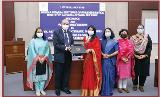
Valedictory Session of ITP for Batch-II of DR-ASOs