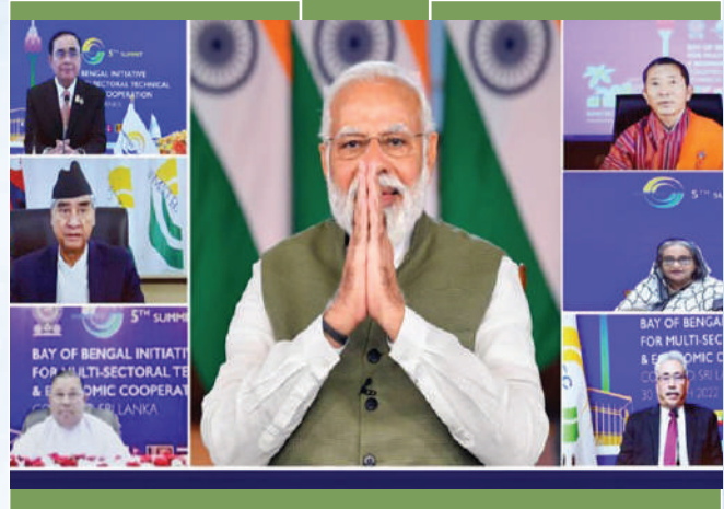
MoUs signed with BIMSTEC Member States