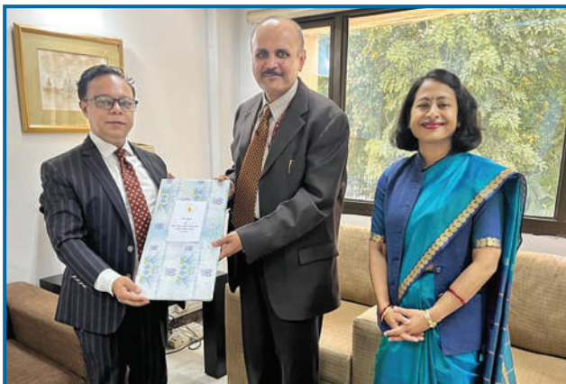
Presentation of mementos by Dean (SSIFS) and DG, Foreign Service Academy, Bangladesh