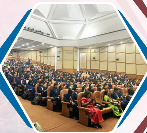
Participants at the 96 th Foundation Course