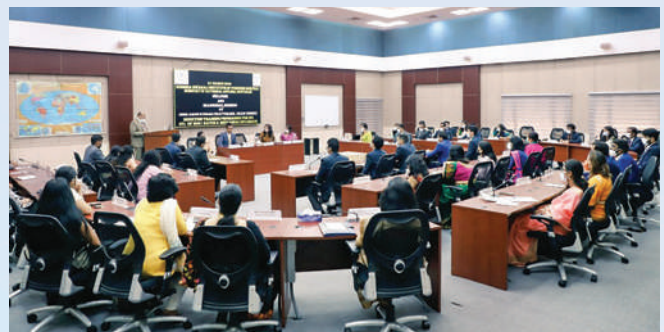
Welcome address by Dean (SSIFS)