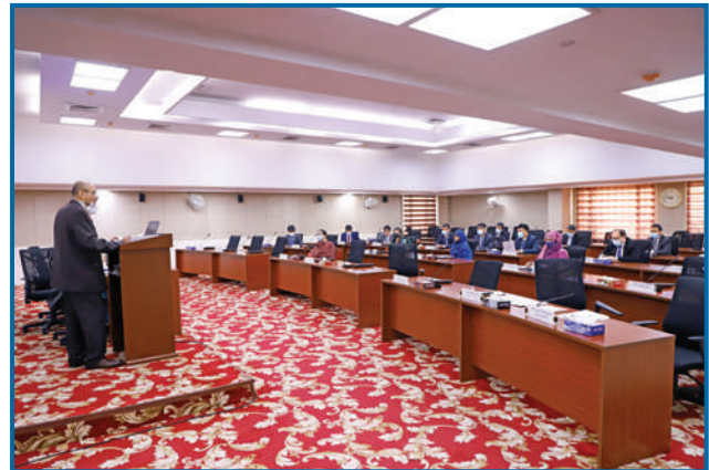
Address by Dean (SSIFS)