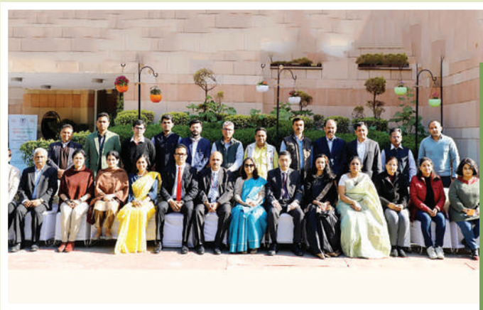
Participants of the Special Course on Foreign Policy for Indian Media