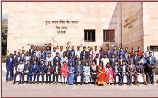
Participants of ITP for Batch-II of DR-ASOs

and drafting, forms of official communication, Conduct Rules, IFS PLCA, gender sensitization, office etiquette, dress code etc. In addition, there were a few sessions on India's culture, polity, economy and globalization, foreign policy, ITEC, Development Partnership Cooperation, Indian Diaspora and emotional intelligence. The programme concluded with a session on Heartfulness Yoga to promote long-term general well-being. The Valedictory Session was held physically at SSIFS during which Certificates of Participation were given to the ASOs. They were invited for a valedictory lunch as a culmination of the ITP.