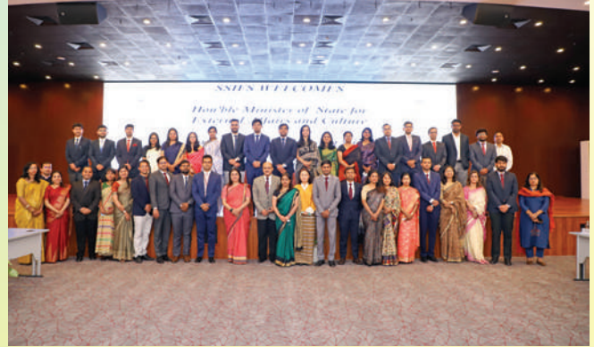
Call by IFS OTs on Minister of State for External Affairs & Culture, Smt. Meenakshi Lekhi