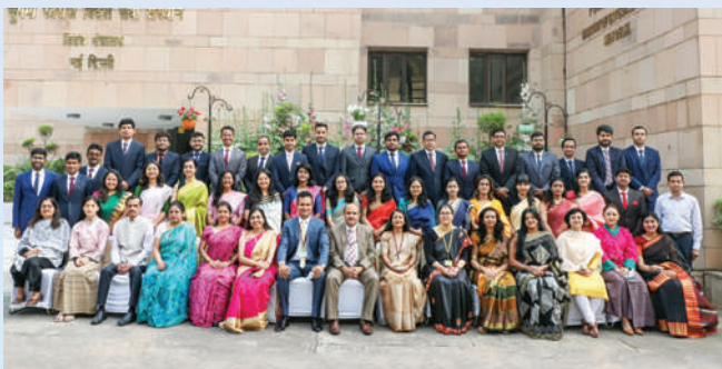
IFS OTs 2021 Batch with Team SSIFS

the IFS OTs and Bhutanese diplomats called on External Affairs Minister, all three Ministers of State (External Affairs), Foreign Secretary and all the other Secretaries of MEA. The officers also attended sessions on India's foreign policy conducted by academicians and domain experts, and sessions on structure and function of the Ministry and other administrative matters conducted by officers from MEA.