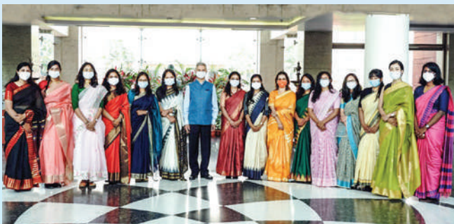
EAM with women IFS OTs 2021 Batch