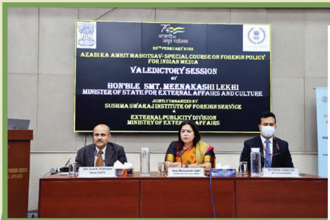
Minister of State for External Affairs & Culture, Smt. Meenakshi Lekhi graced the Valedictory Ceremony