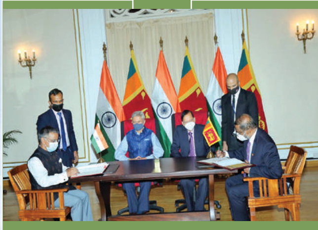
MoU signed with Sri Lanka