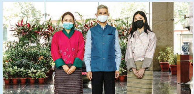
EAM with Bhutanese OTs