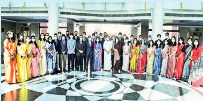
Call by IFS OTs on Minister of State for External Affairs & Parliamentary Affairs, Shri V. Muraleedharan