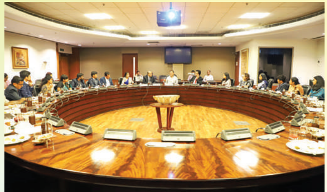
Call by IFS OTs on Minister of State for External Affairs & Education, Dr. Rajkumar Ranjan Singh